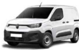
Citroen Berlingo Van MK3 2018-present