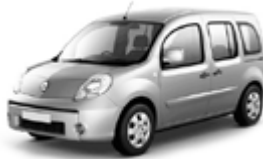
Renault Kangoo MK2 2009-2020