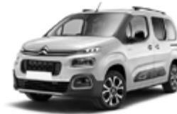
Citroen Berlingo (& e-Berlingo) MK3 2018-present