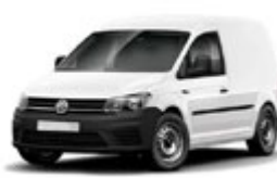
VW Caddy Van 2008-2020