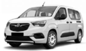
Vauxhall Combo (& Combo-e) 2018-present