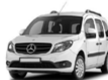
Mercedes Citan 2012-2020