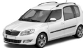
Skoda Roomster 2006-2015