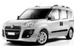
Fiat Doblo MK2 2010-2020