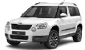
Skoda Yeti 2009-2017