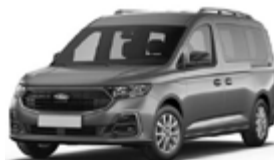
Ford Grand Tourneo Connect 2022-present