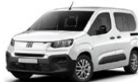
Fiat Doblo MK3 2022-2026