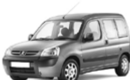
Peugeot Partner MK1 1998-2009