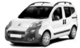
Citroen Nemo 2009-2015