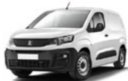
Peugeot Partner Van MK3 2018-present