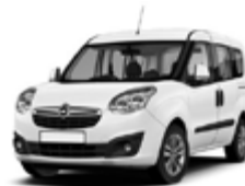
Vauxhall Combo 2011-2017