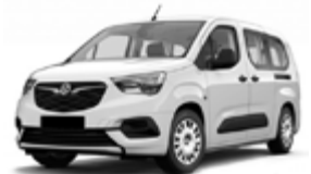
Opel Combo Life (& Combo-e) 2018-present