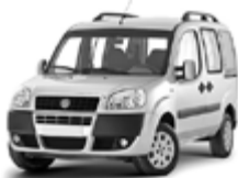
Fiat Doblo MK1 2001-2010