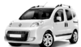
Fiat Qubo 2008-2020