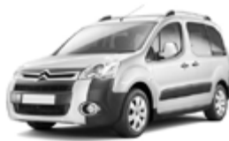
Citroen Berlingo MK2 2008-2018