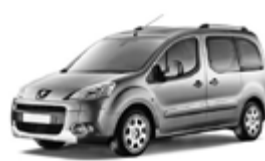
Peugeot Partner MK2 2008-2018