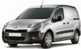
Peugeot Partner Van MK2 2008-2018