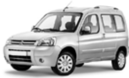
Citroen Berlingo MK1 1998-2009

Our car camper van conversion modules are available for the cars listed here and are designed to work with cars fitted with rear seats. 7 seater variants must have the boot seats removed prior to installation of the module.