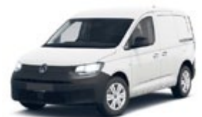
VW Caddy Van 2021-present