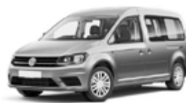
VW Caddy Maxi Life 2008-2021