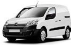
Citroen Berlingo Van MK2 2008-2018