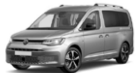
VW Caddy Maxi Life 2021-present