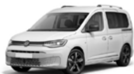
VW Caddy Life 2021-present