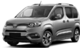
Toyota Proace City Verso 2020-present