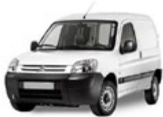
Citroen Berlingo Van MK1 1998-2009

Our VAN MAX camper van conversion modules have been designed specifically for panel vans and are available in short or long versions . Please note that our VAN MAX system is NOT compatible with vans with rear seats fitted and is NOT compatible with ribbed floors; the van floor must be flat (typically plywood lined).