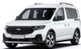
Ford Tourneo Connect 2022-present