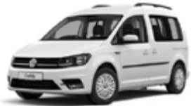
VW Caddy Life 2008-2021