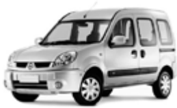
Renault Kangoo MK1 1999-2009