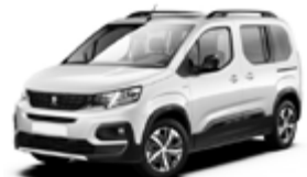
Peugeot Rifter (& e-Rifter) 2018-present