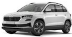
Skoda Karoq 2017-present