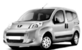
Peugeot Bipper Tepee 2009-2015